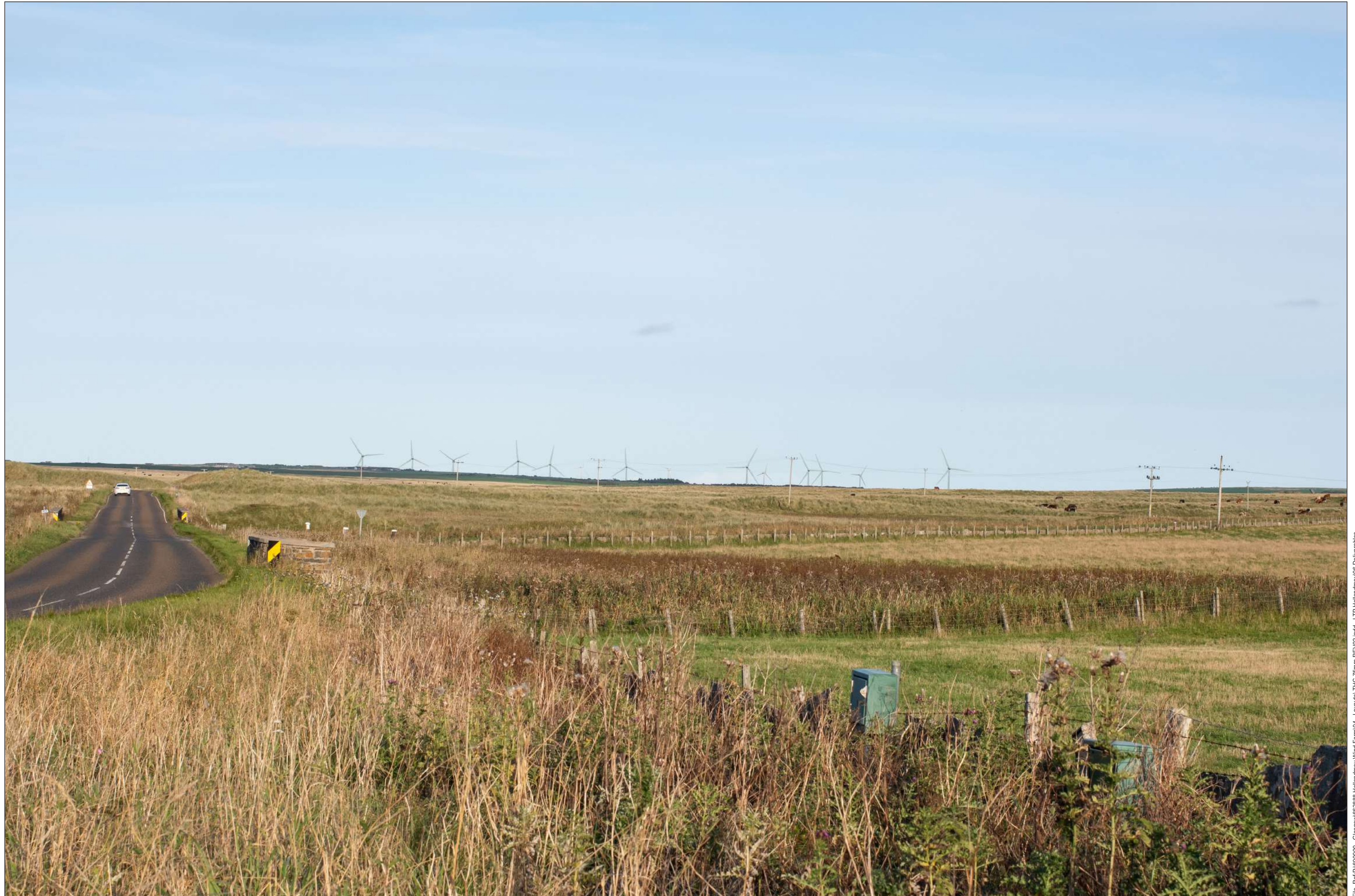
Figure: 7.35-THC-04 Viewpoint 22: A836 East of Castletown

Planar Projection Distance to nearest turbine: 8.3 km Camera: Nikon D810 36.3 - Full Frame Focal length: 75 mm Camera Height: 1.5 m Date: 23/092020 Time: 17:40