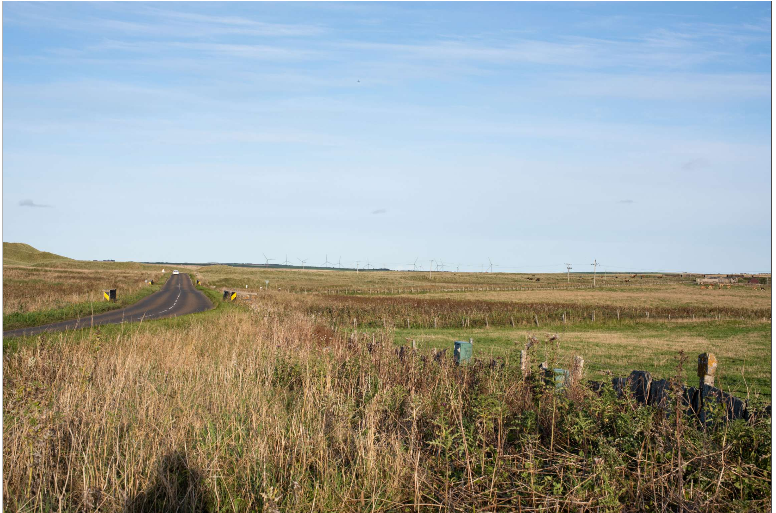
Figure: 7.35-THC-03 Viewpoint 22: A836 East of Castletown

When viewed at a comfortable arm's length (approx. 500 mm), this printed image is representative of our detailed central vision, but is not representative of scale and distance.